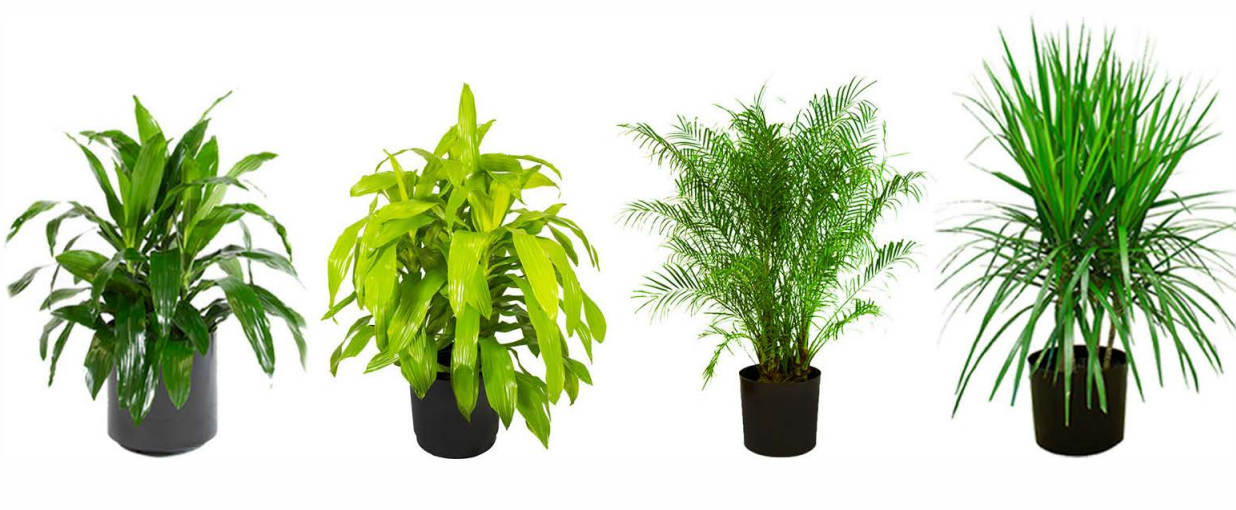
3 ft. Janet Craig