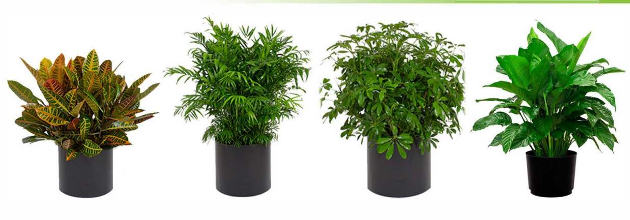
2-3 ft. Croton